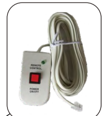
Order No.: RC-1700